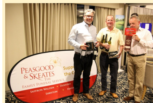
The winners of the Saffron Walden Charity Golf Day putting competition.

We were delighted to provide the prizes for the putting competition at the Charity Golf Day held at Saffron Walden Golf Club .