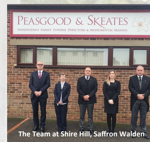
The Team at Shire Hill, Saffron Walden